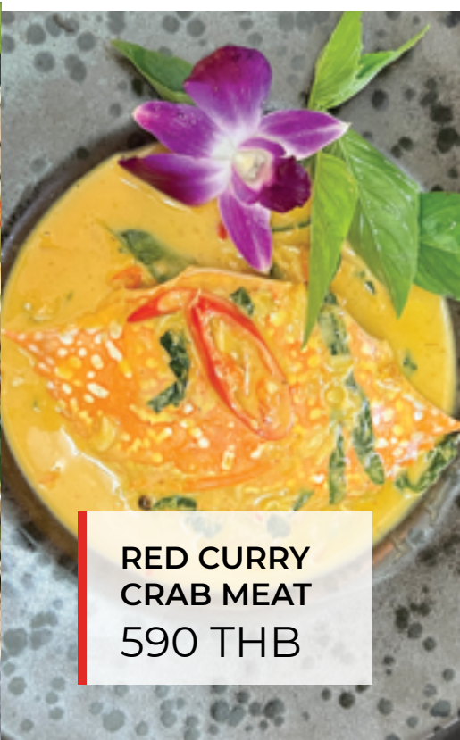
RED CURRY CRAB MEAT 590 THB