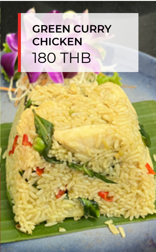
GREEN CURRY CHICKEN 180 THB