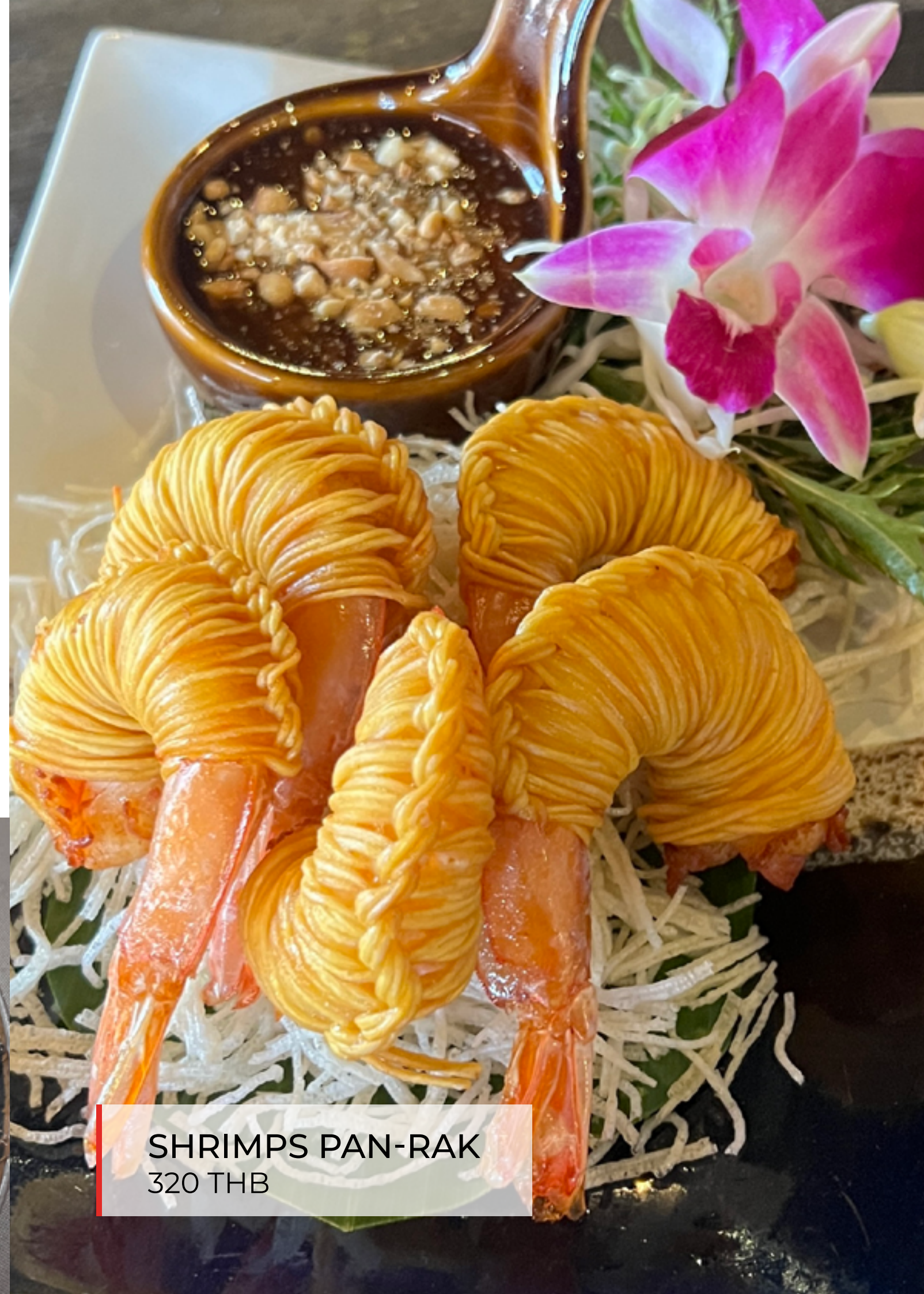
SHRIMPS PAN-RAK 320 THB