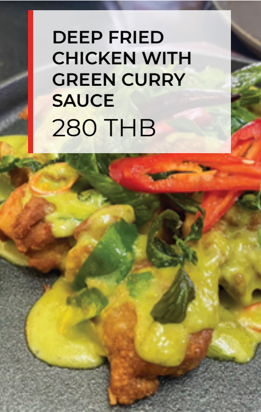
DEEP FRIED CHICKEN WITH GREEN CURRY SAUCE 280 THB