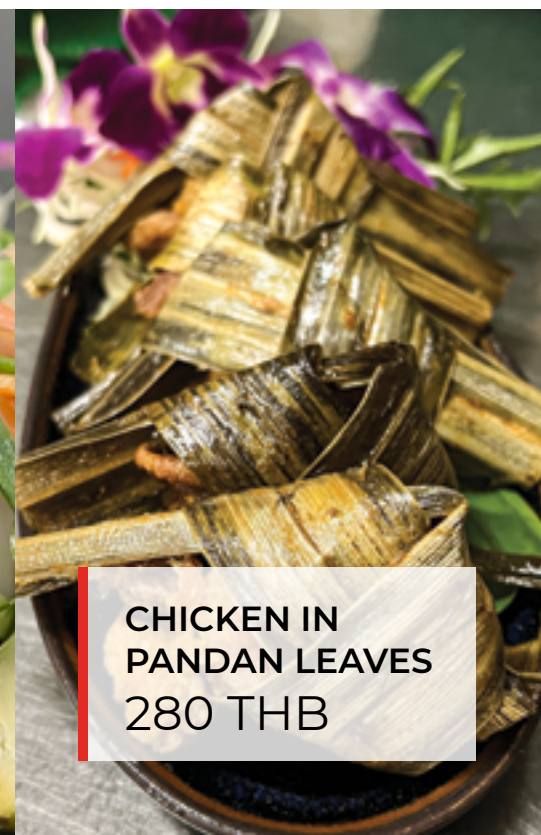
CHICKEN IN PANDAN LEAVES 280 THB