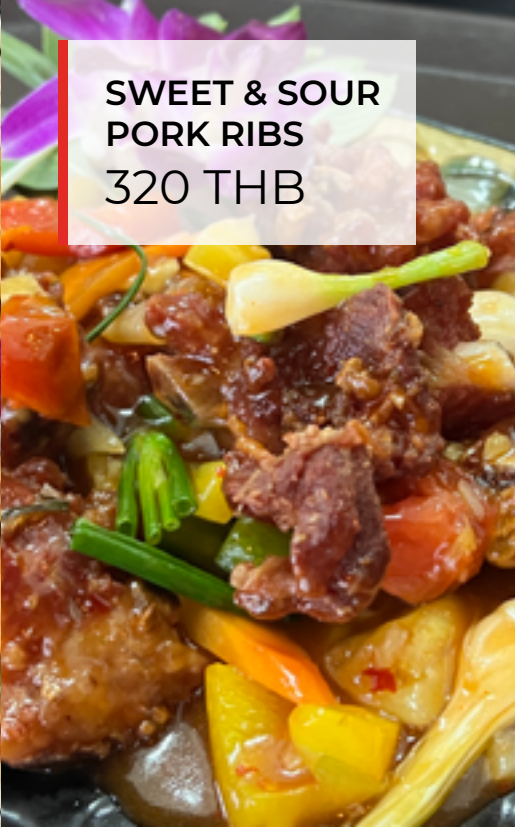
SWEET & SOUR PORK RIBS 320 THB