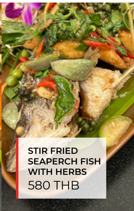
STIR FRIED SEAPERCH FISH WITH HERBS 580 THB