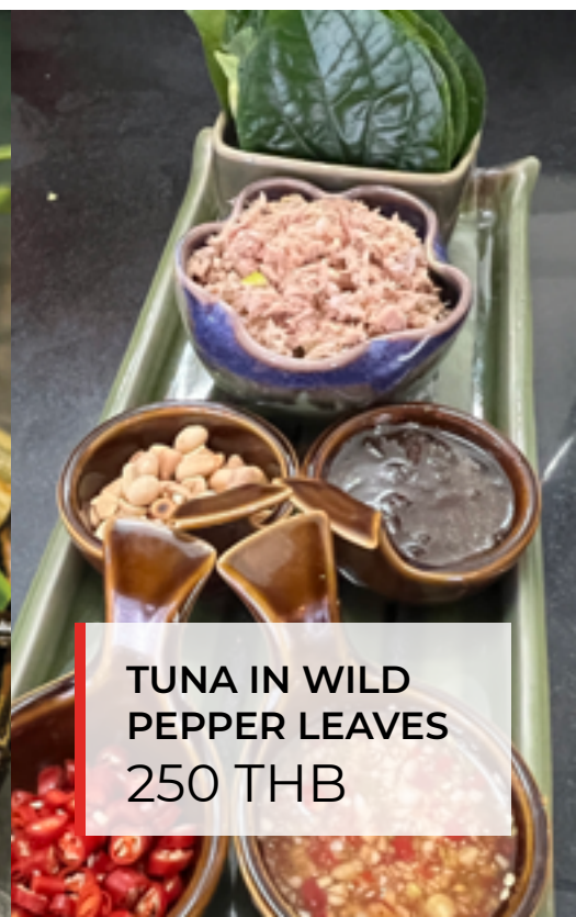
TUNA IN WILD PEPPER LEAVES 250 THB