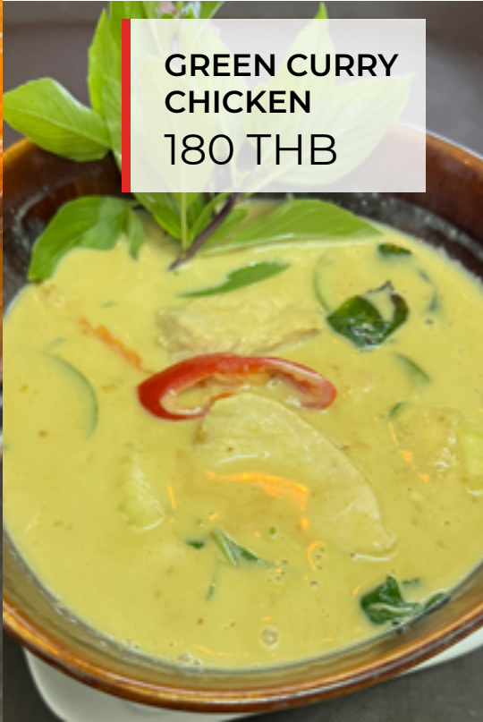
GREEN CURRY CHICKEN 180 THB