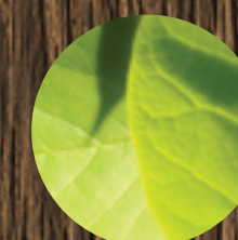
LIME KAFFIR LEAVES

PRICES DON'T INCLUDE 7% VAT. WE ACCEPT VISA MASTERCARD UNIONPAY & ALIPAY