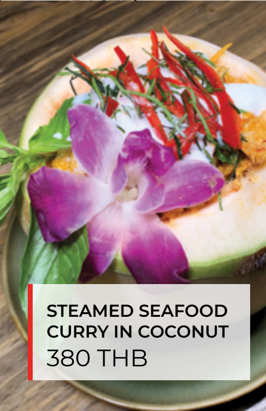
STEAMED SEAFOOD CURRY IN COCONUT 380 THB