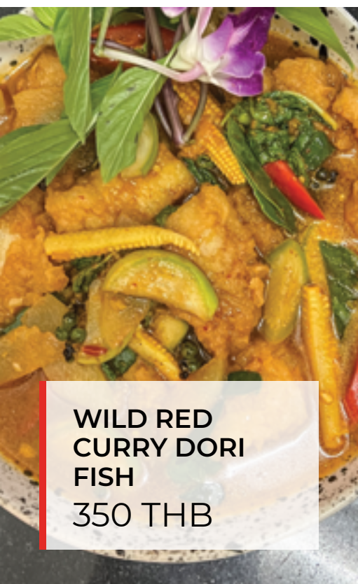
WILD RED CURRY DORI FISH 350 THB