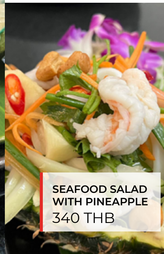
SEAFOOD SALAD WITH PINEAPPLE 340 THB