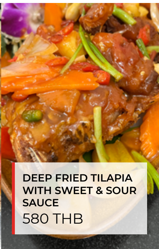
DEEP FRIED TILAPIA WITH SWEET & SOUR SAUCE 580 THB