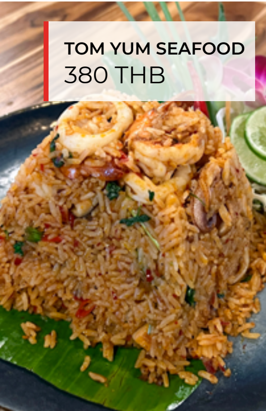
TOM YUM SEAFOOD 380 THB