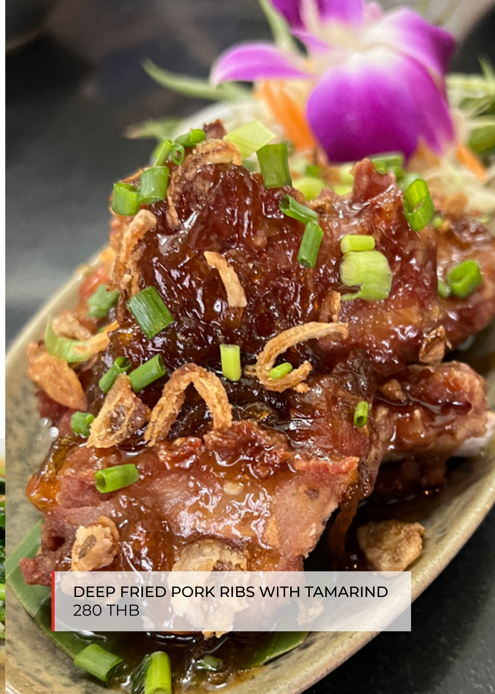
DEEP FRIED PORK RIBS WITH TAMARIND 280 THB