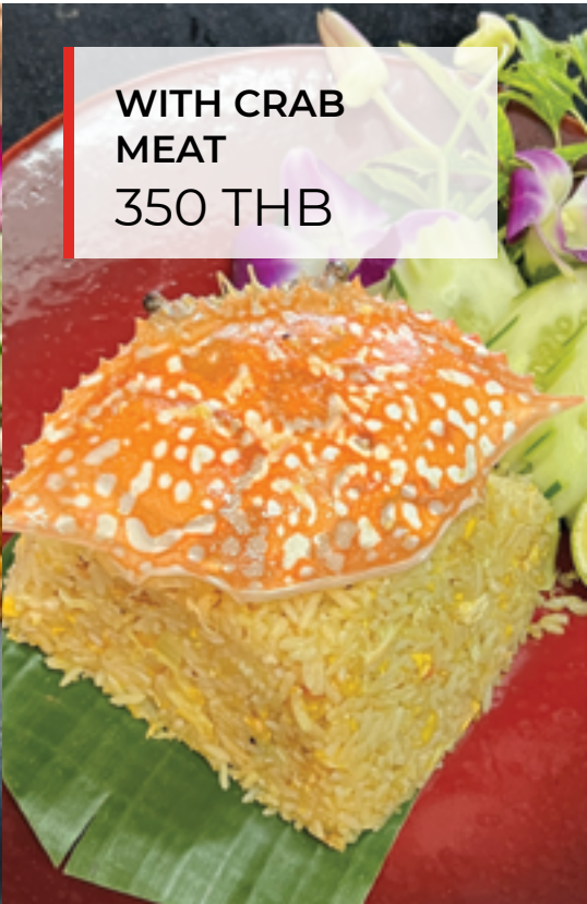
WITH CRAB MEAT 350 THB