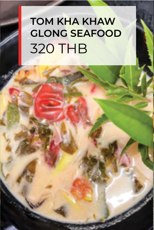
TOM KHA KHAW GLONG SEAFOOD 320 THB