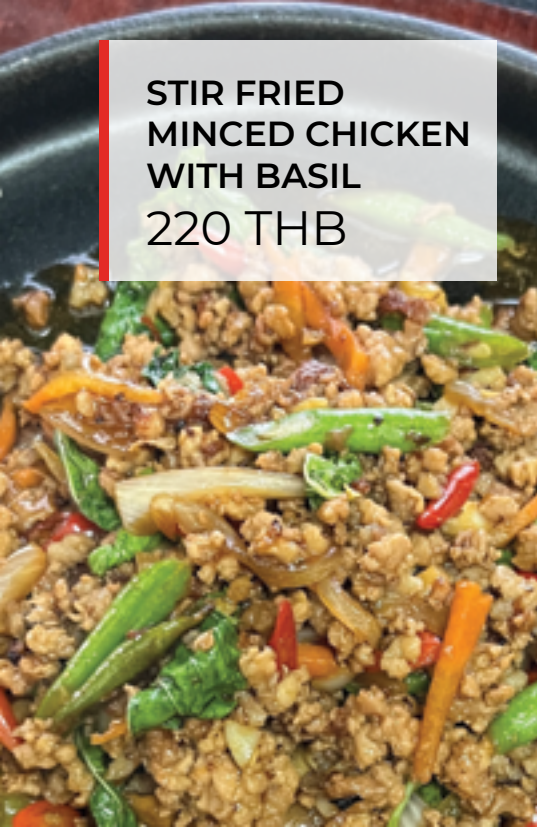
STIR FRIED MINCED CHICKEN WITH BASIL 220 THB