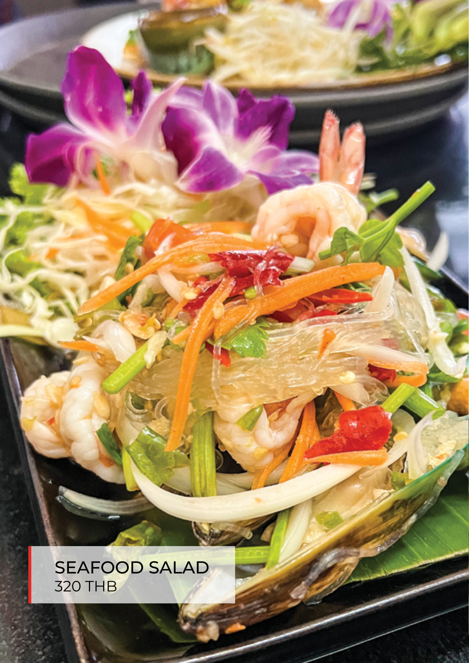
SEAFOOD SALAD 320 THB