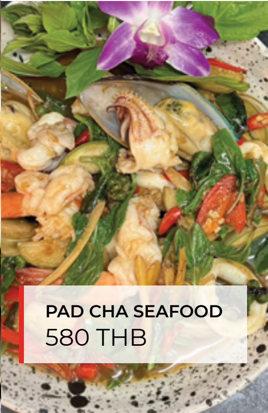
PAD CHA SEAFOOD 580 THB