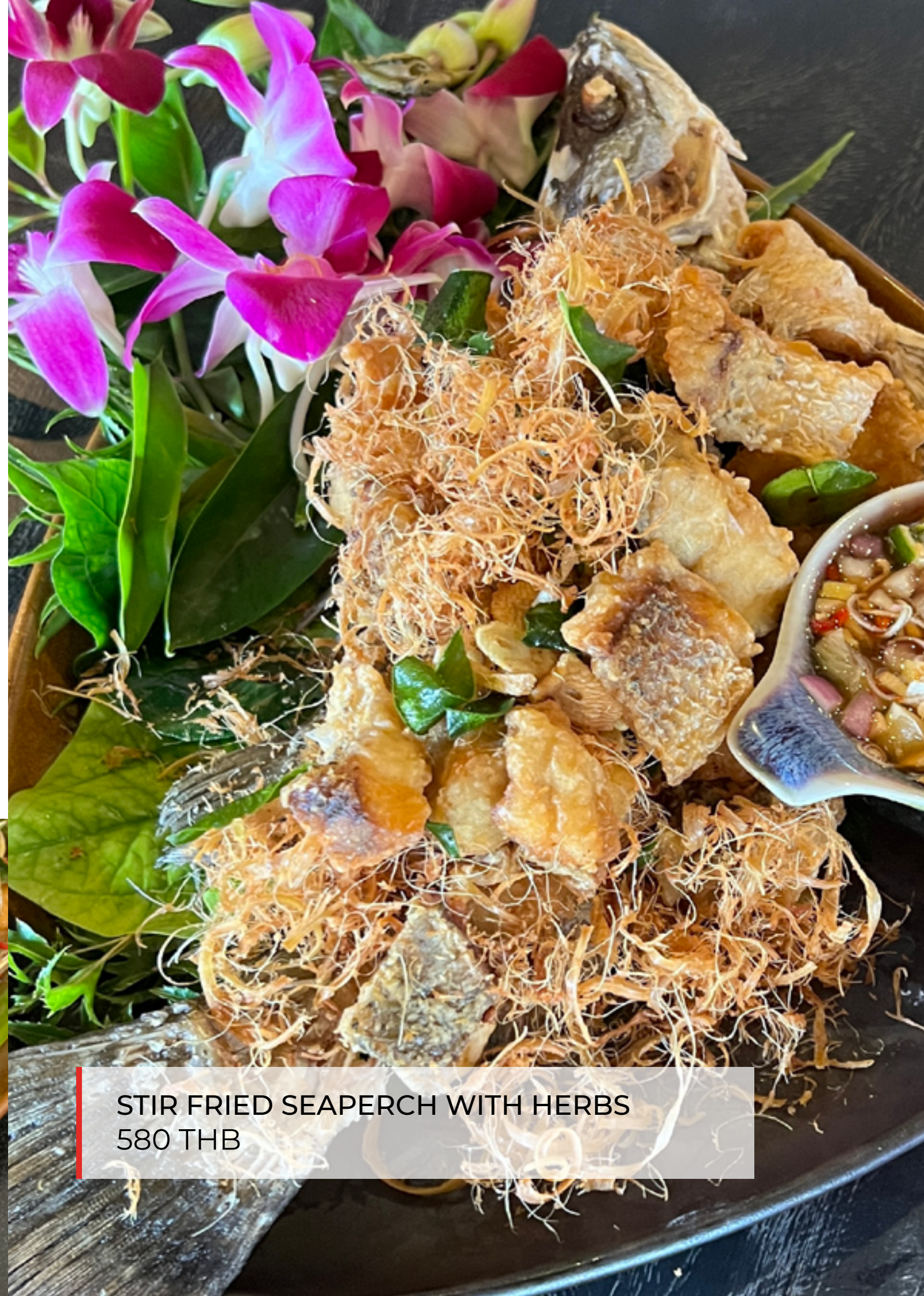
STIR FRIED SEAPERCH WITH HERBS 580 THB